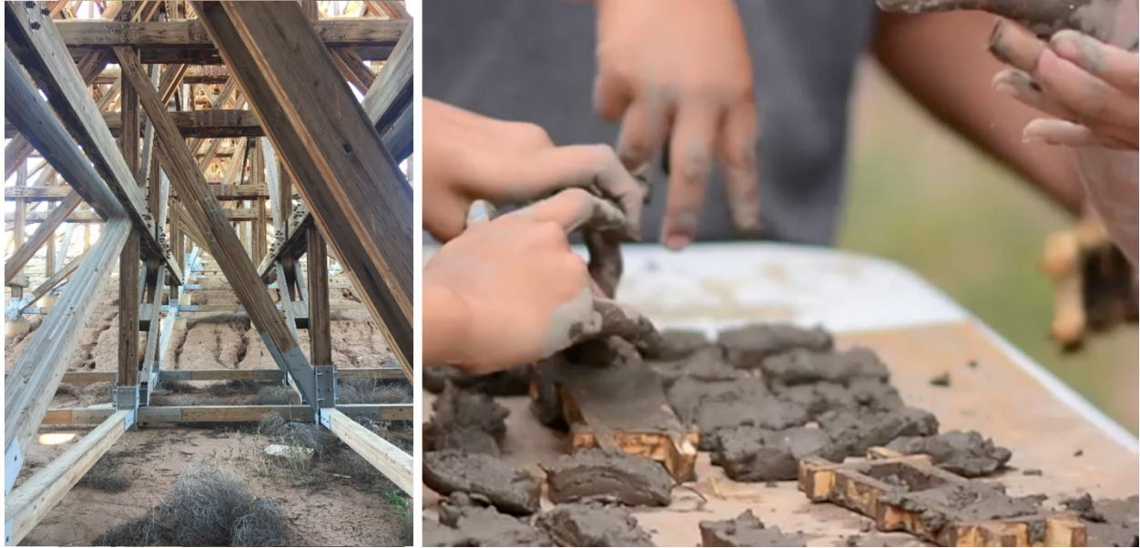
Figure 5: The ATLAS-1 Trestle, Kirtland Air Force Base (active 1972 – 1991, defunct today), and an adobe building workshop: two architectures in/of the high desert.