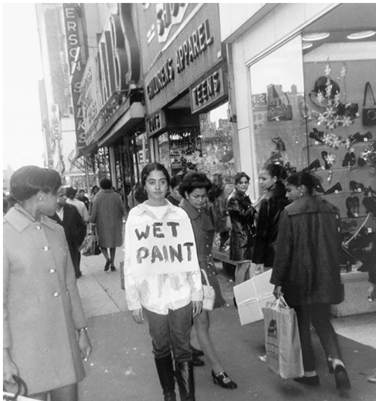
Figure 2: Adrian Piper, Catalysis III : Documentation of performance, 1970.

of conceptual artists of the decade and obliged the public around her to take notice. About this performance, she wrote that “[the] process/product is in a sense internalized in me, because I exist simultaneously as the artist and the work.” 10 In another example, she walked around popular department stores wearing a sign that read “WET PAINT”, and observed as people around her became visibly perplexed. In this series, her body became the art object. By performing her art in public rather than in a gallery, she turned the societal mirror outward, insisting that those she encountered react to her as representation and as object. This was both a personal dissolution of the subject-object dichotomy and an effort to undermine the image bestowed upon her by others. In a sense, this created a confrontation of perspectives from which her art could be understood: through her own being, through representation, and as an isolated art object/performance.